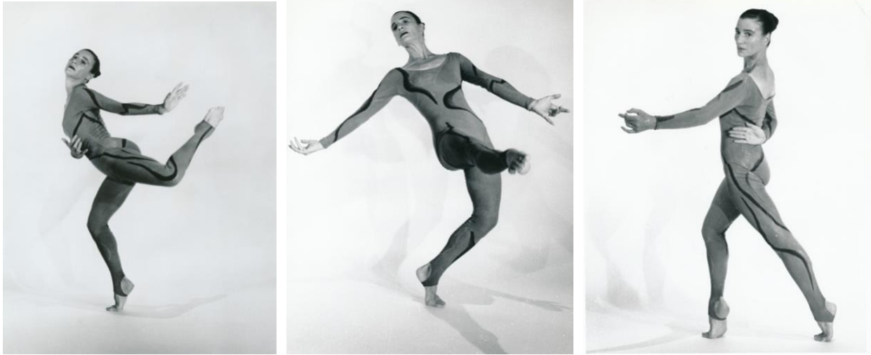
Bella Lewitzky, 1970

Bella Lewitzky died on July 16, 2004. At age 88, her physical health had deteriorated but her vital spirit continued to inspire those around her. Designated one of America's Irreplaceable Dance Treasures by the Dance Heritage Coalition and awarded the National Medal of Arts by President Clinton, Lewitzky's life demonstrates how an artist with vision and tenacity changed the lives of her fellow citizens for the better.