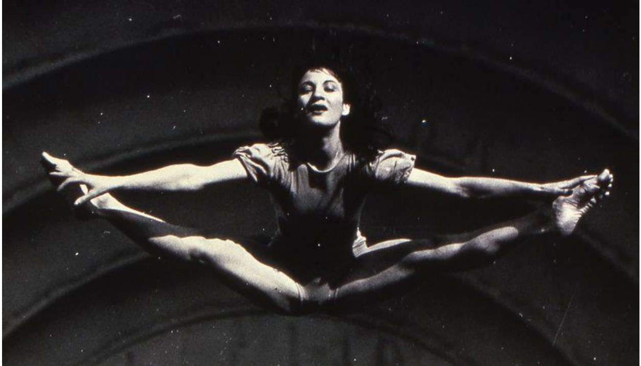
Bella Lewitzky at the Hollywood Bowl, 1938

The film, Bella , is about the life, influence and impact of California-based artist and activist Bella Lewitzky. Described as "...one of the greatest American dancers of our age," (Walter Terry) Bella Lewitzky was a talented, strong, out-spoken artist, who dedicated her creative life to protect the rights of every American citizen. Designated one of America's Irreplaceable Dance Treasures by the Dance Heritage Coalition and awarded the National Medal of Arts by President Clinton, Lewitzky's life demonstrates how a "uniquely Californian" artist with vision and tenacity can change the lives of her fellow citizens.