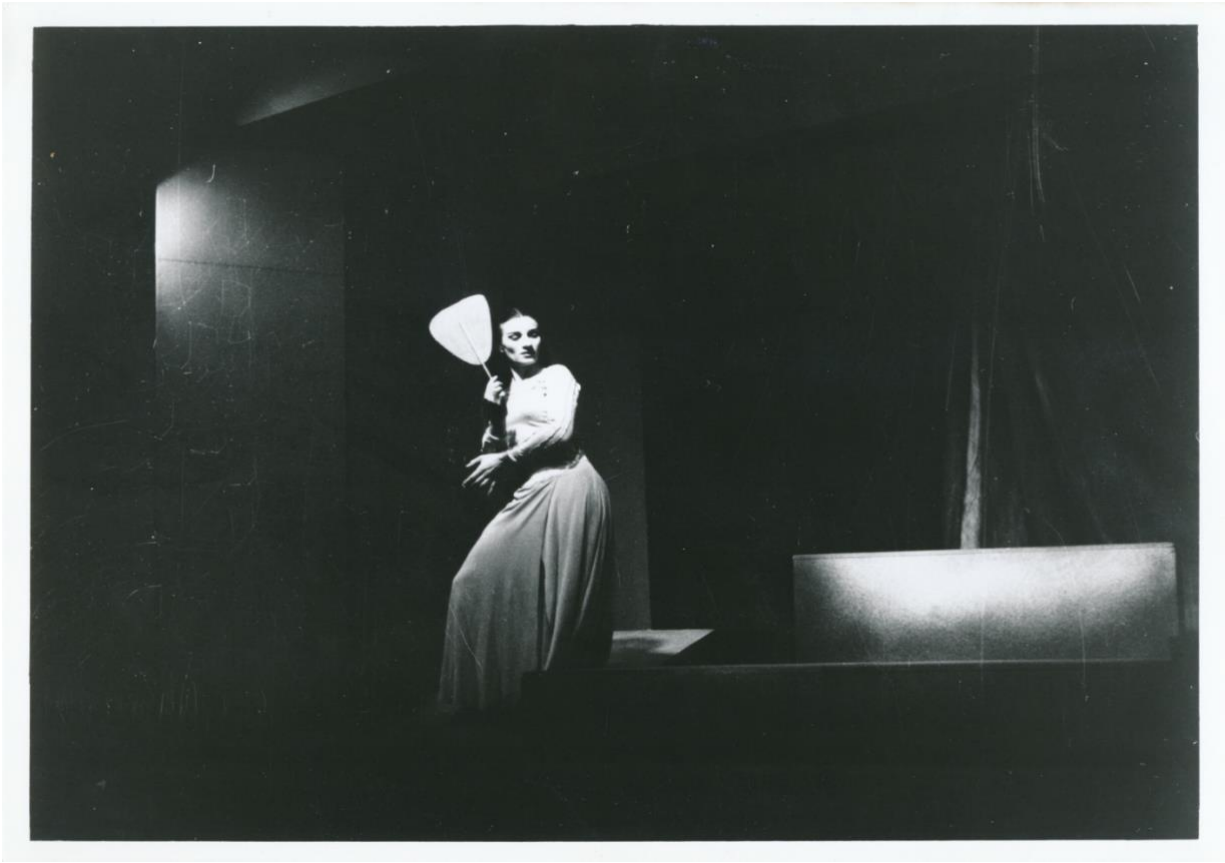
Bella Lewitzky in Salome, choreographed by Lester Horton, 1948

Born while her parents were members of the socialist Llano Del Rio Colony in the Mojave Desert, raised on a chicken farm in Highland CA, Lewitzky became the star of the Lester Horton Dance Group based in Los Angeles, the first American inter-racial dance company.