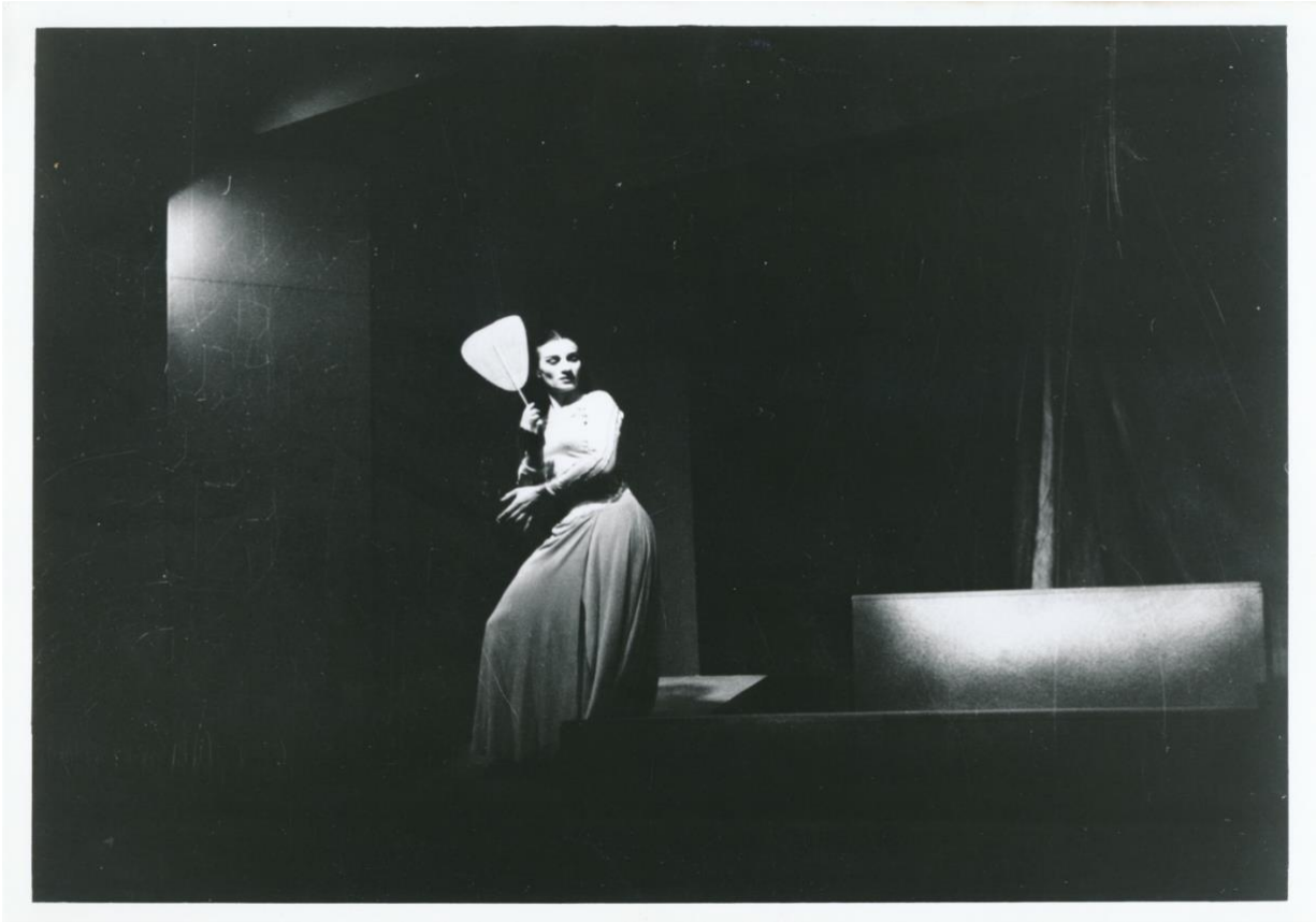
Bella Lewitzky in Salome , choreographed by Lester Horton, 1948