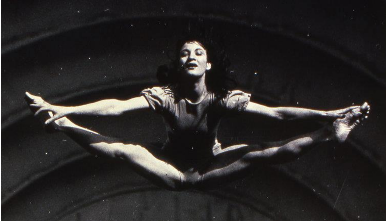
Bella Lewitzky at the Hollywood Bowl, 1938