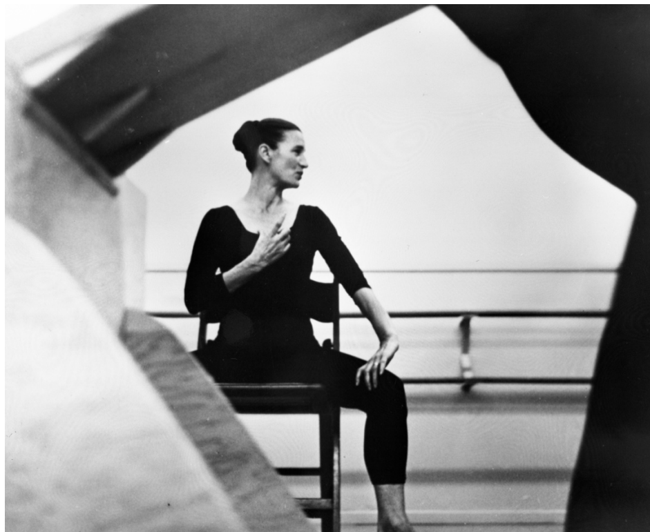
Bella Lewitzky, California Institute of the Arts, 1972