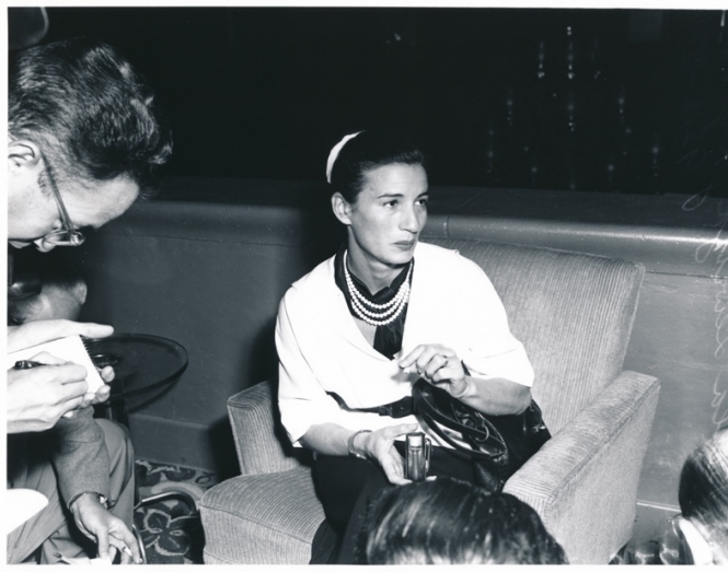
Bella Lewitzky, House American Activities Committee Hearing, 1951

standards of decency and respect for the diverse beliefs and values of the American public." This process took time away from Lewitzky's choreography and fund raising. After a re-organization she decided to close her company with a final international tour and gala. On May 17, 1997 at the Luckman Theatre at Cal State LA, the campus where her company gave its first performance, she said good-bye to her audience and stated, "The arts are under threat more than ever before. What legacy I have left here will die unless you become responsible for keeping it alive." This case and the actions of the NEA changed the funding structure for the arts in the United States. Individual grants are no longer given to artists, but must be supported by institutions.. At age 88, her physical health had deteriorated but her vital spirit continued to inspire those around her. Lewitzky's life demonstrates how a "uniquely Californian" artist with vision and tenacity can change the lives and landscapes of her fellow citizens for the better. Bella Lewitzky died on July 16, 2004.