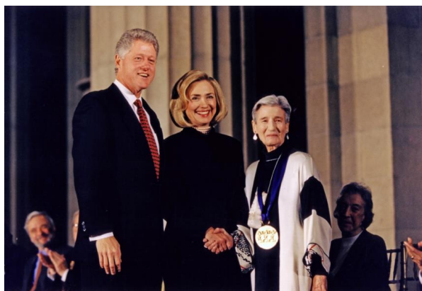
Bella Lewitzky Awarded the National Medal of the Arts by President and Mrs. Clinton