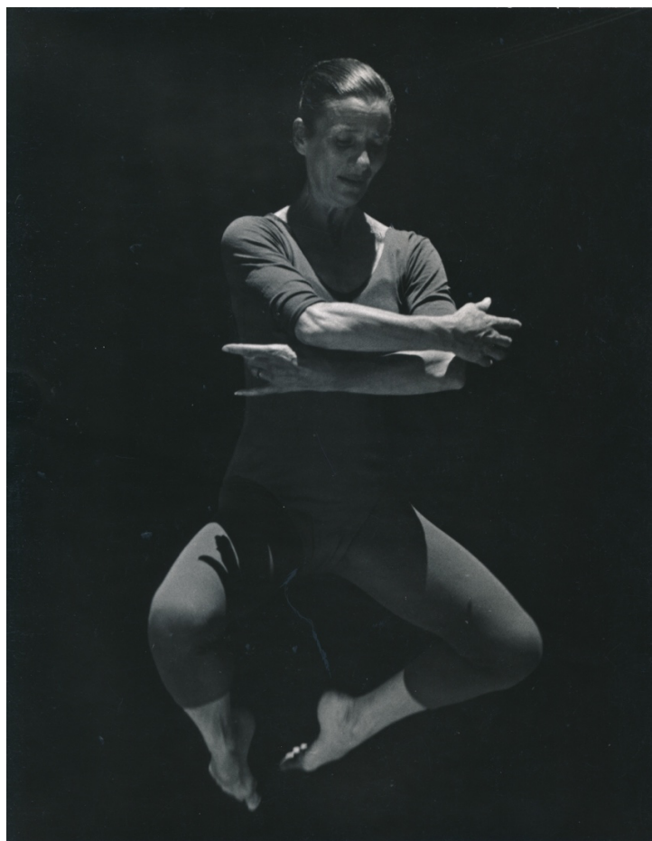
Bella Lewitzky, Bella Lewitzky Dance Company, 1966

This is the story of a strong, talented, outspoken artist, who gave her creative life to protect the rights of every American citizen. Born while her parents were members of the socialist Llano Del Rio Colony in 1916, raised on a chicken farm in Highland, Lewitzky became the star of the Lester Horton Dance Group, the first American inter-racial dance company. Based in Los Angeles in the 1930s and 40s she was the primary developer of the Horton technique. Her students included Alvin Ailey and Carmen De Lavallade who went on to form the Alvin Ailey company in New York. The Horton technique is taught world-wide, and unlike modern techniques developed in the eastern United States, is based on Native American dance. In Lewitzky, Horton found the body upon which he would build his technique, a uniquely west coast modern dance. Lewitzky's move to the Los Angeles in 1930 from San Bernadino with her family exposed her to a new kind of intensity. She lived in a diverse, working-class neighborhood at the height of the depression. As the lead dancer of the Horton Company, Lewitzky starred in his productions of "Salome" and "Rite of Spring" at the Hollywood Bowl in 1937 to rave reviews. Her work in "Tierray libertad," a comment on the Spanish conquest of Mexico, and